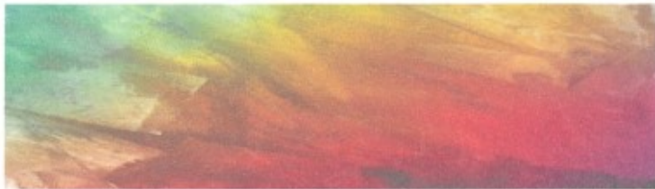
"Myths and Legends"