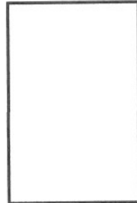
Vertical 12" wide x 18" high